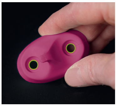
Backside with yellow core. Shell in white and magenta.