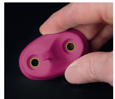
Backside with yellow core. Shell in white and magenta.