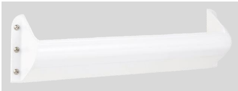
Front View (White Antimicrobial Powder Coat)

We stock 12", 18", 24", 30", 36", 42", and 48" nominal lengths. Custom lengths are available from 6 inches to 12 feet.