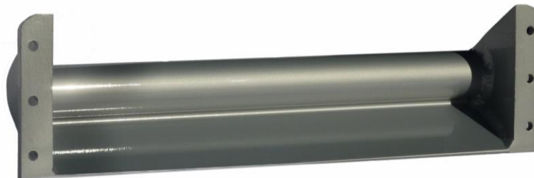
Rear View (Silver/Clear Powder Coat)